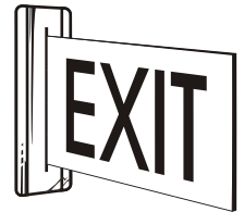
END MT FREE LENS