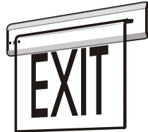
"WATERFALL" WALL MT