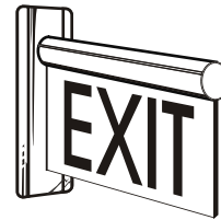
END MT STANDARD