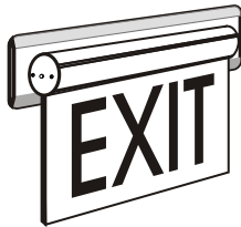
STANDARD WALL MT