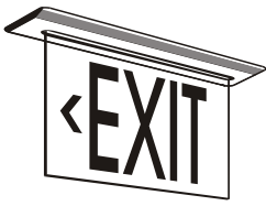
TOP MT RECESSED